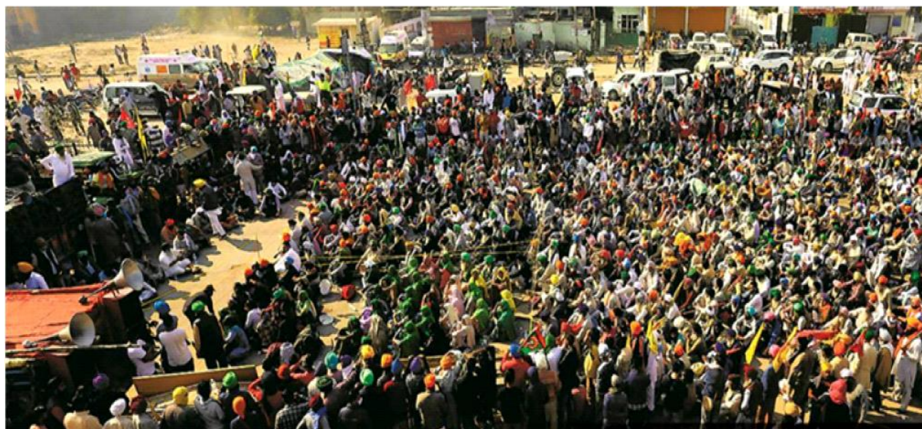
And the Blockade