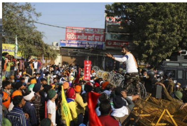
Face to Face