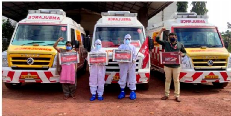
Frontline Covid-19 Fighters in Kerala