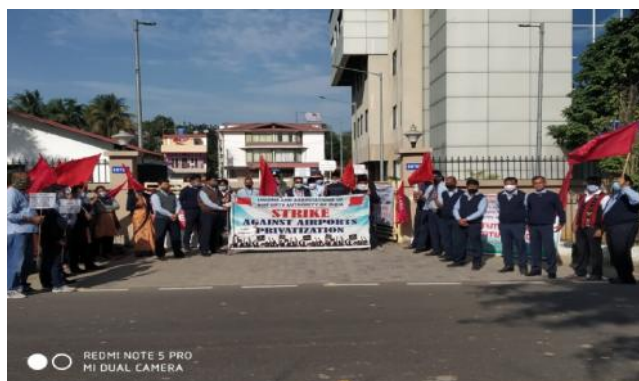
At Closed Airport in Guwahati (Assam)