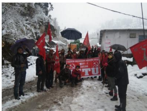
In the Snowfall in Kullu (H.P.)