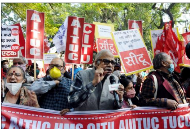
At Jantar Mantar in New Delhi