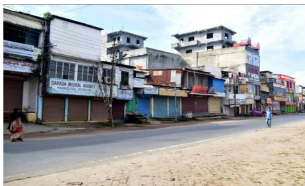
A Deserted Road in Agartala (Tripura)