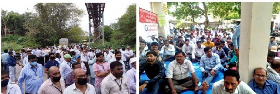
Anapara Power Plant