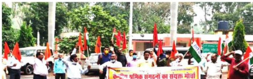
8 October Protest at Singrauli of Northern Coalfield Ltd

Pursuing their 12 point demands including - cancellation of auction of 41 coal mines for commercial mining, re-scheduled on November 9; - opposing any attempt of privatisation / disinvestment of PSU coal companies; - opposing attempt to separate CMPDIL from CIL; - for compensation and jobs to the land losers and rescinding Coal India Annuity Scheme 2020; - against any unilateral decision of closing coal mines; - workers service related 5 demands; for withdrawal of anti-workers Labour Codes and anti-farmers three farms Acts; - and punitive action against administrative personnel for excesses committed during 2-4 July coal workers strike; the Sanjukt Morcha of coal workers federations of CITU, AITUC, INTUC, HMS and BMS in their joint notice announced their warning agitational programmes in all collieries and establishments of central PSU, Coal India Ltd in all coal bearing States; and Central-State Joint Sector PSU Singareni Coal Company Ltd in Telangana by staging demonstrations and submitting memoranda to the CMDs on 30 September; staging demonstrations, holding gate meetings and mass campaign on 1 October at local level and massive dharna and demonstration in all units of both coal PSUs across the country on 8 October.