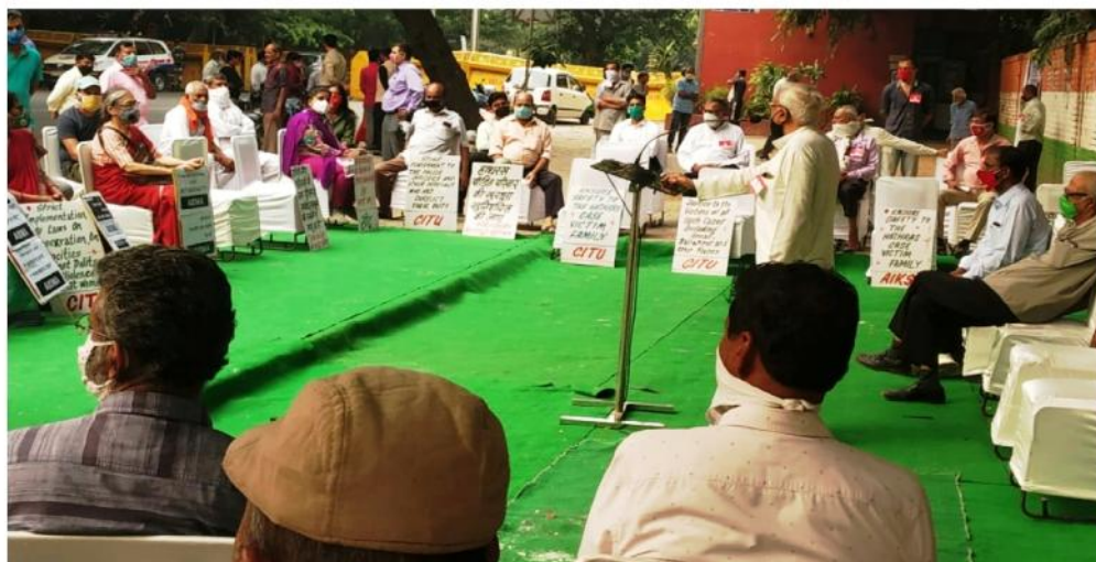
National leaders in dharna at Jantar Mantar

CITU, AIKS and AIAWU gave joint call of countrywide protest on 13 October, 2020 against Hathras Dalit woman's brutal gangrape and murder case and demanding Supreme Court guided investigation.