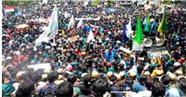
Worker protest in Bandung

"Police fired tear gas at the protesters from several high schools and universities as they tried to approach the palace compound, turning roads into a smoke-filled battleground. The protesters hurled rocks and bottles." "Similar clashes occurred in large cities all over the country, including Yogyakarta, Medan, Makassar, Manado and Bandung."