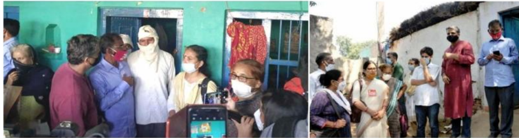
Mass organisations delegation meeting victim's family

A 6-member delegation, representing four national organisations CITU, AIKS, AIAWU and AIDWA; visited Gulgarhi village in Hathras of Uttar Pradesh on 4 October and extended solidarity with the landless family of the Dalit woman who was gangraped and brutally murdered by the landholding upper caste men. It is with great difficulty that the delegation could meet the family of the victim after detention by the police and 3 hours long wait. The village was cordoned off and neighbours terrorised.