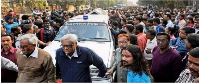
Leading from the front