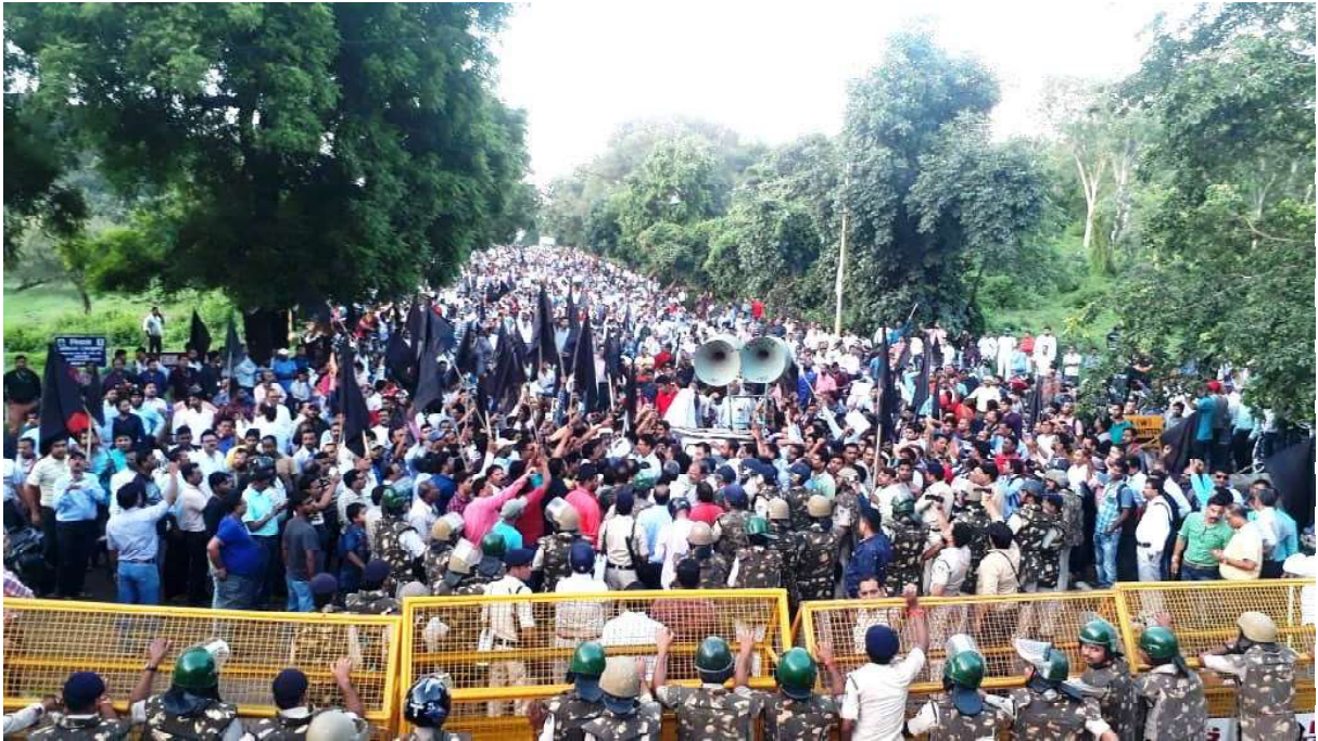
Jabalpur (Madhya Pradesh)