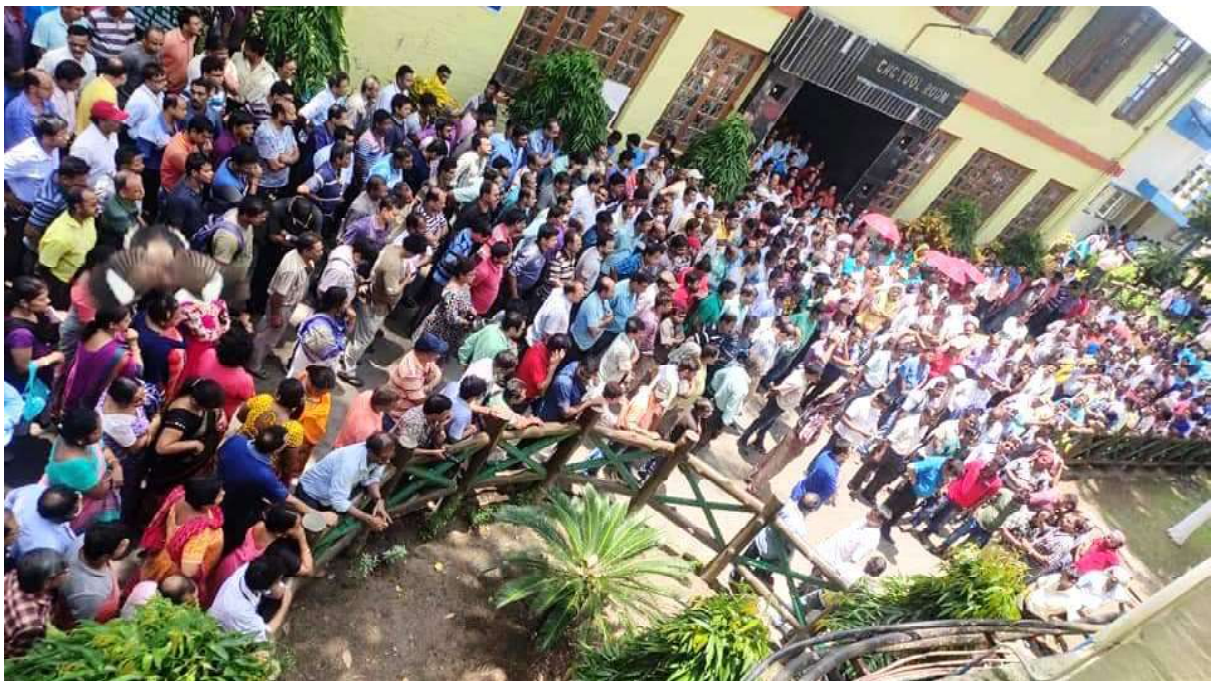
Ichhapore (West Bengal)