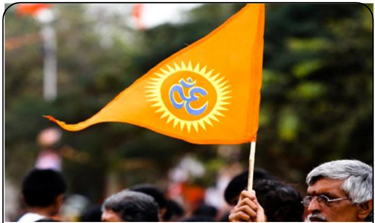
Shambhulal is the middle-class protagonist of Hindutva who destroys our secular dreams and our plural world

As one confronts a closed mind and a closed majority, one realises that a parallel world of categories is being created before which words like democracy and human rights carry little meaning. The great Indian movie is Citizen Shambhulal. He has a solidity, power and presence which push even the great classic Citizen Kane disappear into the margins. Citizen Shambhulal is the other face of the BJP era. As long as Shambhulal is in the majority, the Modi regime is intact. The Shambhulals, in fact, exude a piety they call patriotism and project a machismo where a lynch squad confronts a random victim. Citizen Shambhulal has emerged from our unconscious. He is the middle-class protagonist of Hindutva who destroys our secular dreams and our plural worlds. Padmavati, the film, is like those wall paintings. As you erase the surface, a new picture emerges and below Padukone lies Shambhulal. The modern Indian has come of age. He is the custodian of imaginary histories and an ethic cleanser. He seeks to exorcise history to create a home for his imagined self.