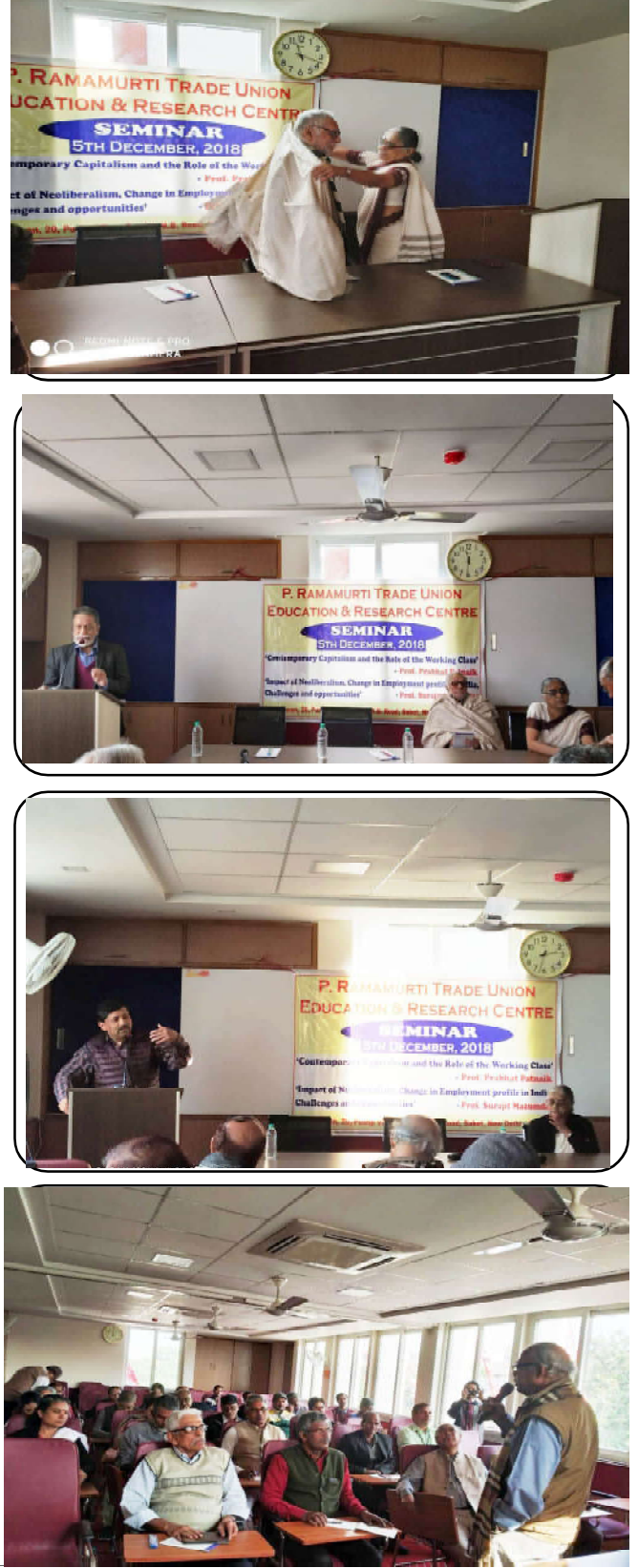
The Voice of the Working Woman

The CITU centre has decided to publish the presentation on both the subjects with questions and answers for their educative value among CITU cadres.